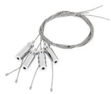
Stainless Steel Cable Kits