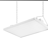
Eye Chain Mount