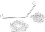
Eye Chain Kits