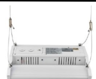
Steel Cable Mount