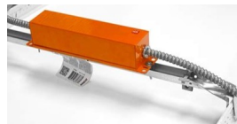
Emergency battery pack