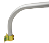
24" Bent Tube